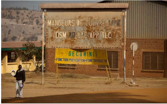
State-owned mining company Gécamines, known as the DRC's 'black box' for its disappearing revenues.

nowhere, Evelyne became the preferred buyer of a valuable DRC state mining asset.