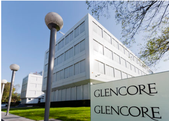
Commodity giant Glencore continues to line the pockets of Gertler.

risk losing its hugely valuable copper and cobalt assets in DRC.