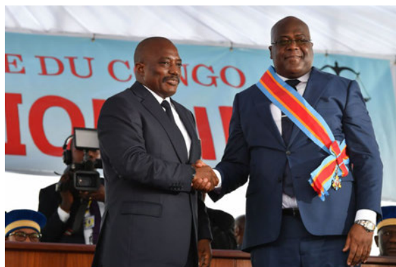
DRC's outgoing President Kabila shakes hands with newly inaugurated President Tshisekedi on 24 January 2019. Kabila has retained influence over many of DRC's institutions.

The US sanctions were intended to disrupt and prevent Gertler continuing with business as usual in DRC. The evidence presented in this report suggests they have not done so and highlights how the well-resourced and well-networked can find ways around such measures by leveraging the opacity of the international financial system.