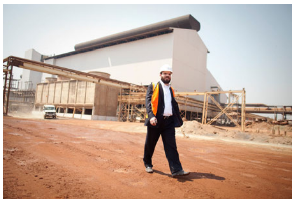
Dan Gertler was sanctioned by the US for “corrupt mining and oil deals” in DRC.

In June 2018, the US added another 14 entities affiliated with Gertler to its sanctions list. The Treasury Department said that these companies have “enabled Dan Gertler to access the international financial system and profit from corruption and misconduct”. 26 Following this second round of designations, a total of 34 individuals and entities connected to Gertler, including Gertler himself, had been sanctioned under the Global Magnitsky Act. 27 Following a March 2020 OFAC revision, one of these companies was removed from the sanctions list. 28