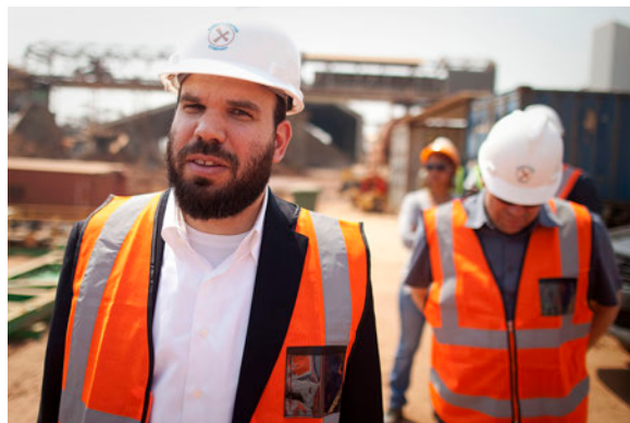
Dan Gertler tours a mining site in DRC in 2012. Despite being sanctioned since 2017, the Israeli billionaire has not changed his ways.

Finally, sanctions regimes including the US must investigate the individuals and companies named in this report that may have aided and abetted Dan Gertler's evasion of sanctions, and consider designating them as sanctioned persons. The lax enforcement of regulation by banks, company service providers and lawyers is what allows