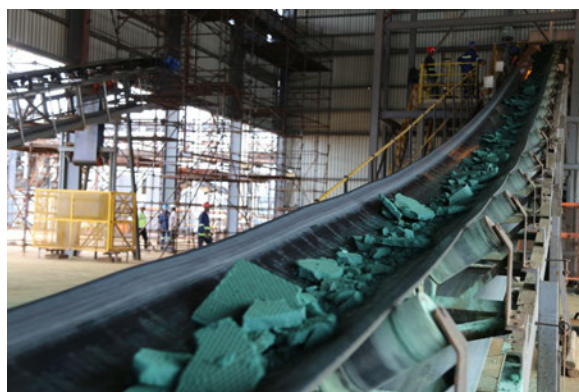
A conveyor belt carries chunks of cobalt at a plant in Lubumbashi. DRC is home to nearly 50% of the world's cobalt.

When the US Treasury imposed sanctions on Gertler it sent shockwaves through DRC's mining sector, as one of its most prominent figures had been cut out of the international financial system, making business with him much more extremely difficult. However, evidence suggests Gertler and his associates used Afriland Bank, a DRC commercial bank offering transactions in both U.S. Dollars and E.U. Euros, to try and obscure potentially sanctioned activities. Evidence